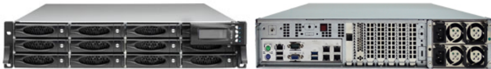
2U 12Bays Single Xeon Platform

Mid-range NAS UNIFIED Storage family offering high performance, scalability, high availability for vertical market and backup or repository applications