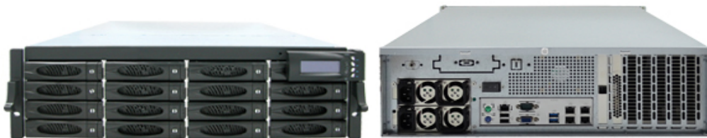
3U 16Bays Single or Dual Xeon Platform